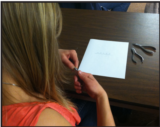
Bending orthodontic wires