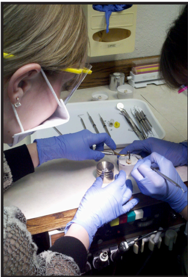
Placing composite filling