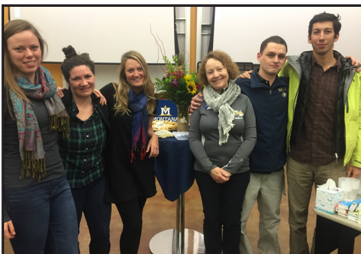
A supportive community