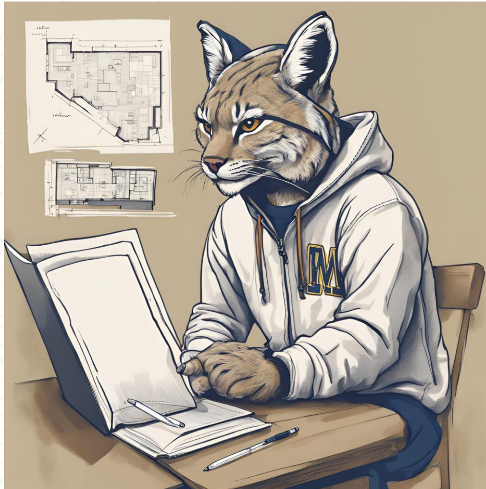
Image generated by AI