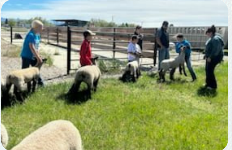
Thank you to everyone who helped and came out to participate.