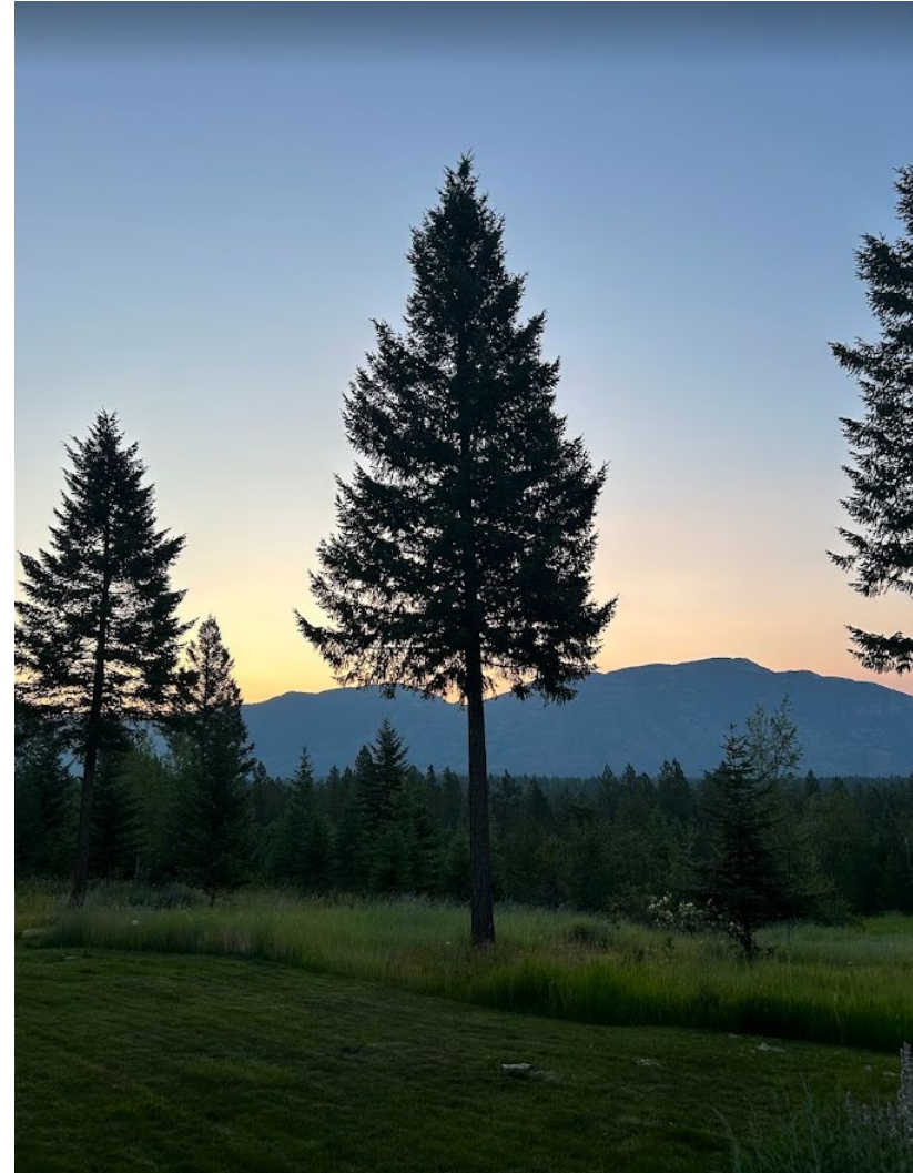
Columbia Falls, MT