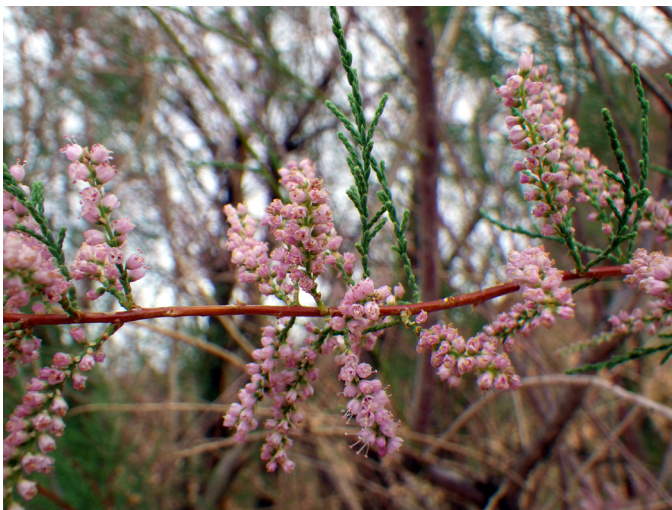
FIGURE 3. Branch showing leaves and flowers of saltcedar.

not use more water than native vegetation. Thick stands of saltcedar may present other problems though. High densities of saltcedar can congest river channels and create potential flood hazards. Saltcedar also reduces channel widths by decreasing the water velocity and thereby increasing sediment deposition.