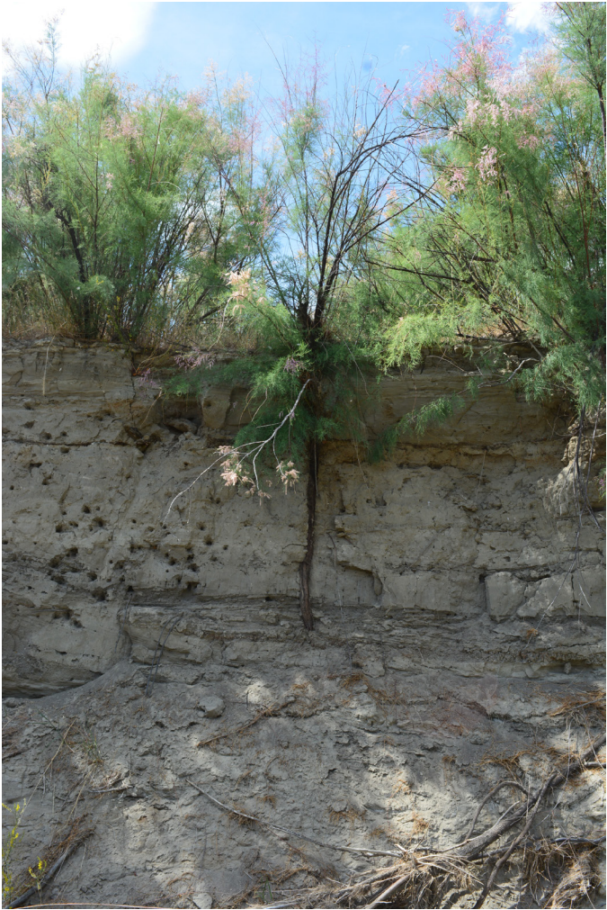
FIGURE 4. Saltcedar has a large primary root and branching secondary roots.

Basal bark treatment involves applying herbicide to the lowest 18 inches of intact stems. Herbicides must be applied to the entire circumference of every stem in order to be effective. This method works best on stems smaller than five or six inches in diameter. Triclopyr can be applied as undiluted PathfinderII® or a 20-30 percent solution of Garlon® or Remedy®. Because saltcedar generally grows in wet areas, caution should be used when applying herbicides to keep them out of ground and/or surface water. Triclopyr and imazapyr should not be applied directly to open water or below the mean high water mark. Furthermore, use caution when applying to permeable soils where a shallow