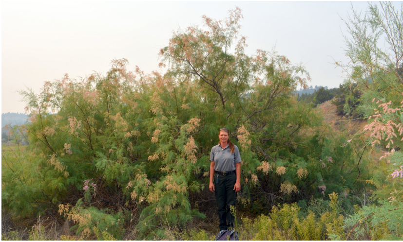
FIGURE 2. Mature saltcedar plant.