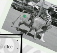
Take Down Saturday Aug 2 9am