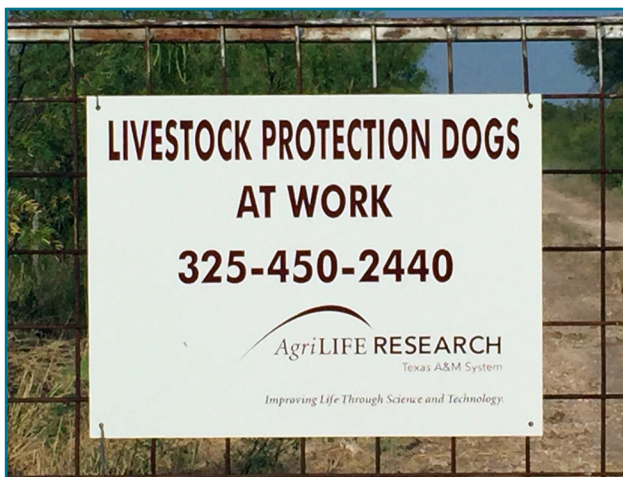
FIGURE 2. Ranchers should use signage that indicates livestock guardian dogs are in the area. This can prevent conflict and provide contact information for people who suspect a problem.

Before you release a guardian dog, tell your neighbors you are adding a dog or dogs to the ranch and what steps you would prefer they take if your dogs are found off the property. It is wise to use dog tags that include contact information and indicate that the dog is a livestock protection animal. Post signs on the ranch boundary with public roads to inform people that guardian dogs are working (Fig. 2).