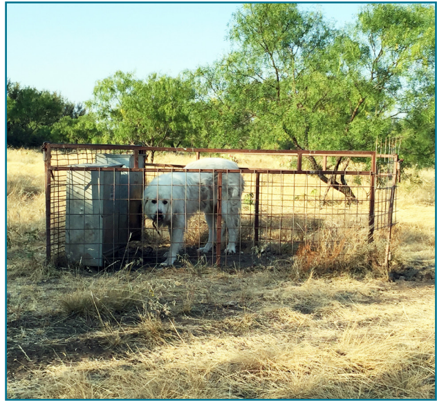
FIGURE 5. This self-feeder is made from three panels arranged as a triangle. The right side of the pen and has a small panel with a 2-foot space at the bottom for dogs to go under.

The number of dogs required for optimal protection varies according to the size of pasture, number of herd groups, topography, flocking instinct of the livestock, number and species of predators, fencing, and guardian dog behavior. The general recommendation is one dog per 100 ewes or does. However, this number is not absolute. Except for small flocks that are close to the house, two dogs are probably more desirable because if one dog is lost the animals will still be protected. On the other hand, flocks of 1,000 or more seldom have more than six LGDs. Start with one or two dogs and evaluate their effectiveness after they reach maturity. Adding newly bonded dogs to a herd that has a mature and effective LGD already in place, is often more successful than starting with three or more untrained dogs. Younger dogs learn from