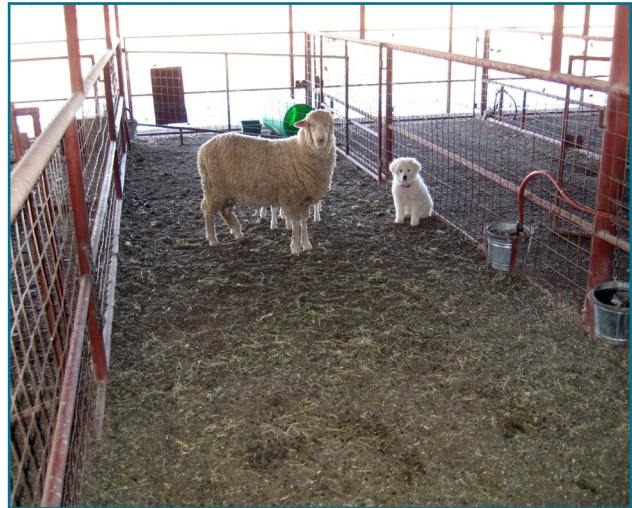
FIGURE 3. This is a bonding pen for young livestock guardian dogs. In this case, a ewe with lambs are being used. It is important to use animals that are accustomed to guardian dogs and include all species of livestock the dog may be required to protect. Do not allow the dog to bite or chew on weak or small animals. The area in the background is blocked off for the guard dog and its feeding station.

The ideal time to begin bonding guardian dogs to livestock is from 4 to 8 weeks of age, while they are still nursing. Research indicates that dogs might not properly bond with livestock if the bonding phase is started after the dog is 16 weeks old.