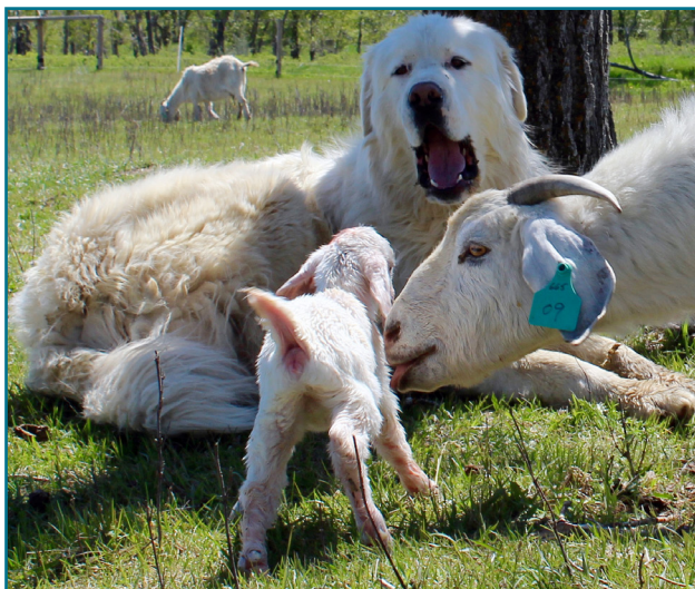
FIGURE 6. Dogs are attracted to animals at parturition and provide added protection when small ruminants are most susceptible to predation.

Health care for LGDs should be planned carefully in consultation with a licensed veterinarian and include scheduled vaccinations, deworming, and heartworm prevention. You should also control external parasites, such as fleas and ticks. Consider rattlesnake vaccines as added protection for LGDs because they are more likely to encounter rattlesnakes than normal pets. Some breeds of guard dogs require grooming to prevent matted coats and heat stress. On occasion, a dog will need help removing porcupine quills. Longevity is one of the most important ways to reduce LGD cost—good health care is essential.