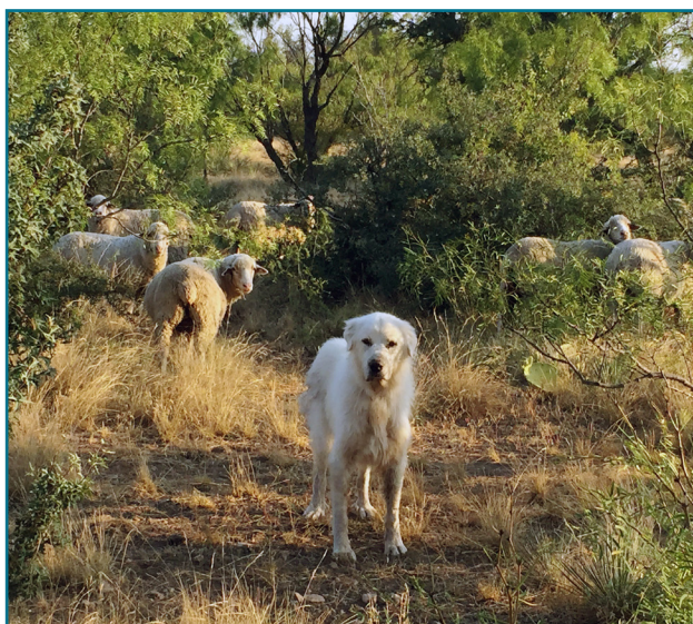
FIGURE 1. Most often, the dominant guardian dogs will investigate disturbances in a pasture and create a buffer space between themselves and their flock/herd.

Some breeders market fully trained or bonded livestock guardian dogs. If you do not have guardian dogs and are suffering heavy predation, this is a good option because trained dogs can begin working immediately. Conversely, it takes 12 to 24 months for puppies to become effective guardians. Trained dogs are more expensive but they are often worth the investment. This is especially true if the breeder offers money back or full replacement guarantees. The risks with purchasing a trained LGD include their running away or failure to bond with