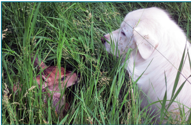
FIGURE 8. This guardian dog found a newborn fawn hidden in tall grass. The guardian dog provided a safe haven for the deer. In other situations, guardian dogs may prey on newborn fawns. How a dog behaves depends on the dog and its environment during the bonding phase.

On many sheep and goat operations, fee hunting for whitetail deer is an important revenue source. Small numbers of guard dogs have been documented to chase, harass, and kill deer. In these instances, the guard dog has identified the deer as a trespasser. If this behavior cannot be corrected, the dog might need to be removed or restrained from specific areas at certain times of the year. On the other hand, dogs that do not interfere with deer and keep predators away provide a safe haven for deer to rear their offspring (Fig. 8). Recent reports indicate that captive deer breeders are using LGDs to decrease predation of fawns.