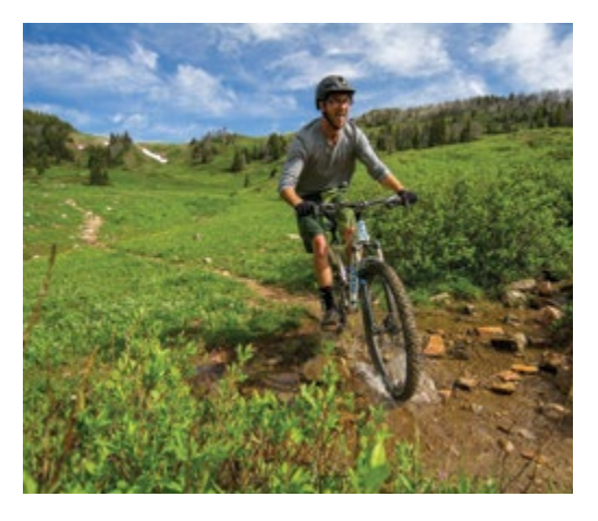
With something for everyone, Bozeman is a truly ideal place to live, work and study.