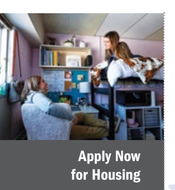
University Housing montana.edu/housing

Off-Campus Housing Marketplace offcampushousing. montana.edu/listing