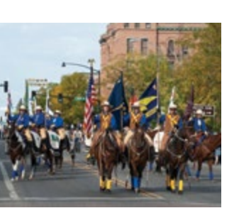
Homecoming Parade, Downtown Bozeman