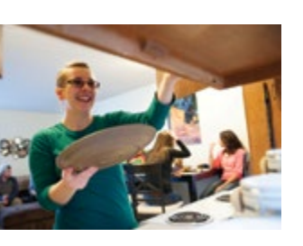
MSU's 12 residence halls give students the opportunity to stay in the center of campus life.