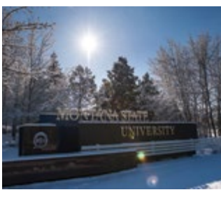
North campus entrance