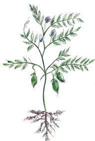
April – Chickpeas