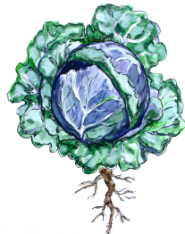
September – Brassicas