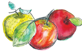
October – Apples