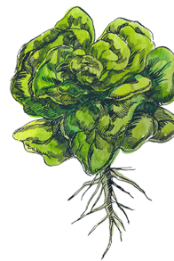
June – Leafy Greens