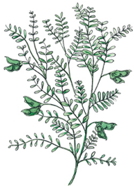
December – Lentils