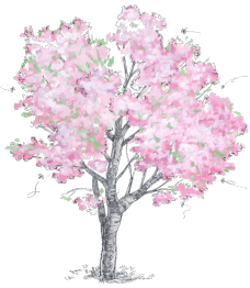
August – Cherries

Although we recommend following this calendar, your school or program can change the order of the calendar to suit your needs. None of the materials are printed with the month. The calendar will likely change each year to include new foods!