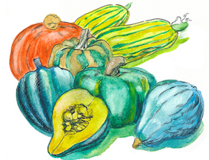
Nov. – Winter Squash