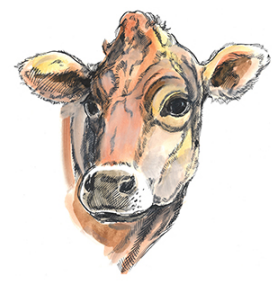
July - Dairy