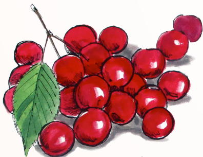
Montmorency - Tart