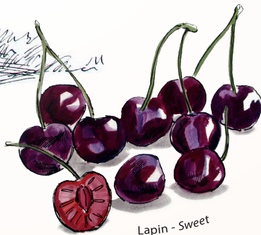
Lapin - Sweet