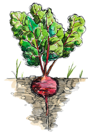
February – Beets