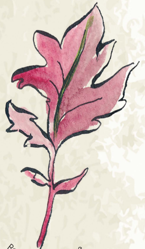
Red Oak Leaf Lettuce