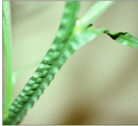
FIGURE 3. Flattened or winged stems.