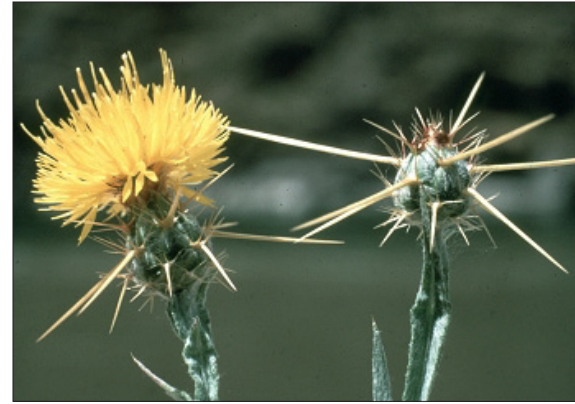
FIGURE 4. Yellow flowers with long spines ( \frac{3}{4} to 1 inch) on the receptacles.

Plumeless seeds are retained in the seed head longer, sometimes remaining through winter or until the plant decays. They typically fall immediately below the parent plant and comprise only 10 to 25 percent of the total number of seeds.