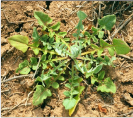
FIGURE 2. Rosette of yellow starthistle.