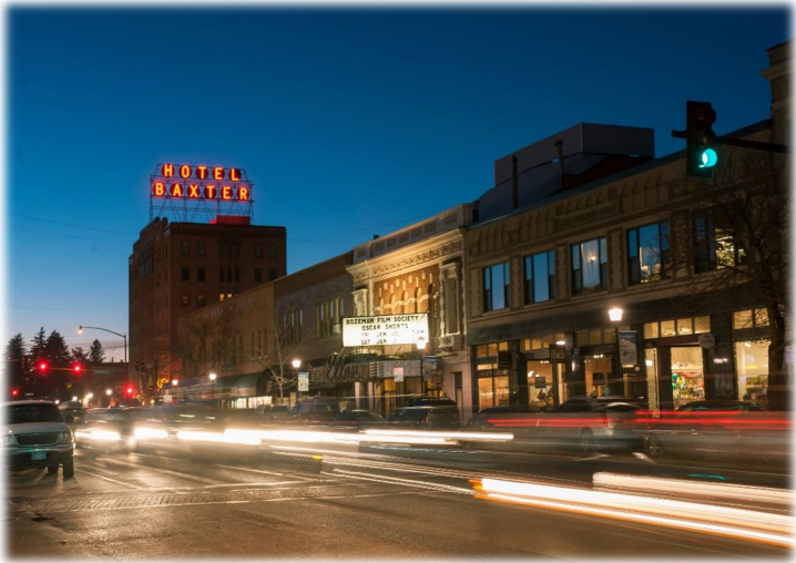
Downtown Bozeman, Montana.

Bozeman's economy has experienced rapid growth in recent years, driven by key industries including technology, tourism, education, agriculture, and healthcare. The city has emerged as a center for tech startups and entrepreneurial ventures, attracting professionals and businesses in fields such as software development, renewable energy, and high-tech manufacturing. Bozeman is home to a growing number of incubators and coworking spaces that support innovation and collaboration among entrepreneurs and creatives.