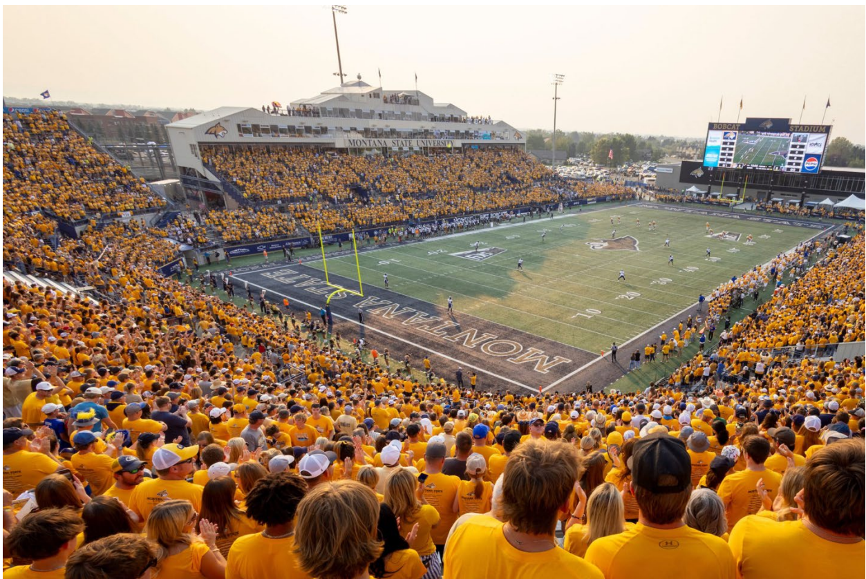
MSU's first home football game of the season is traditionally known as Gold Rush.

Through its emphasis on athletic excellence, academic achievement, and community engagement, MSU Athletics contributes to the overall student experience, boosts school pride, and enhances the reputation of Montana State University. As MSU continues to grow as a leader in higher education, its athletics program remains an integral part of its identity and a vital connection to the broader Montana community. For additional information about MSU Athletics, visit: MSU Athletics