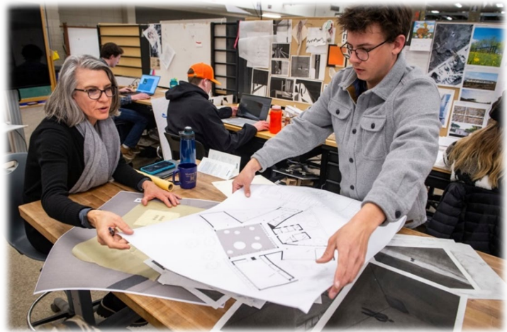
Architecture faculty work with MSU students.