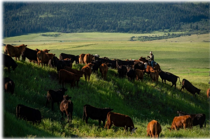
MSU staff work with cattle at Fort Ellis.

MSU Extension's mission is to enhance the well-being of Montanans by fostering knowledge, skills, and innovative solutions in areas such as agriculture, natural resources, family and consumer sciences, youth development, community vitality, and health. MSU Extension works in collaboration with local partners to identify emerging needs, then it plans and prioritizes work to support those needs. For additional information about MSU Extension, visit: MSU Extension